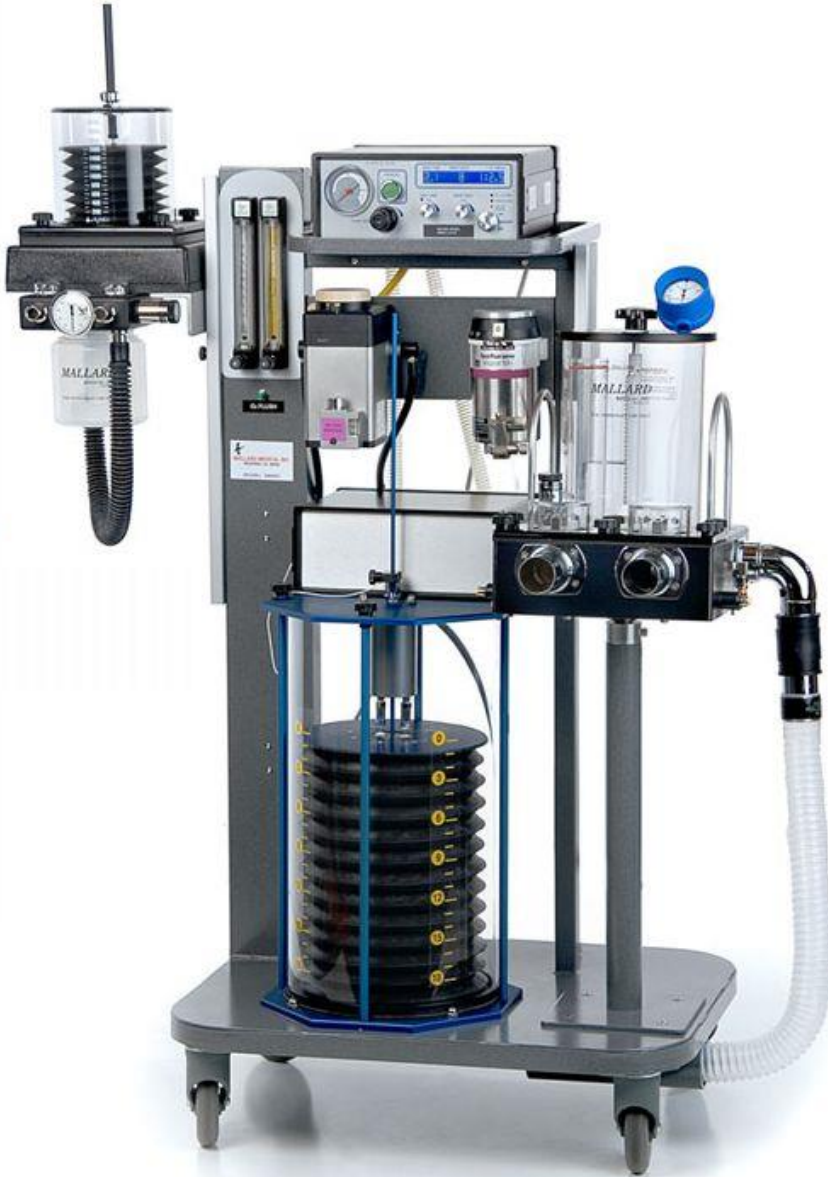
2800C-P (Large Ventilator with 28PBA Pediatric Bellows)

Mallard 2800 Large & Small Animal Anesthesia Ventilators