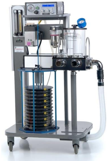
Model 2800C (Large Ventilator)

OPTIONS Medical Air Option: (Optional 0-10 L/M Air Flow Meter and plumbing to mix medical air with default oxygen anesthesia gas.) Optional Vaporizers and Mounts